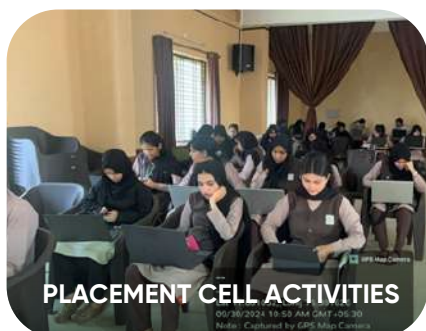
PLACEMENT CELL ACTIVITIES