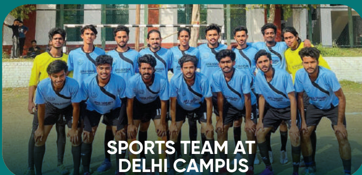
SPORTS TEAM AT DELHI CAMPUS