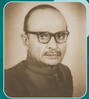
Shri Hakeem Abdul Hameed

The Kannur Campus aims to build meaningful partnerships with the corporate, academic, government and social sectors that result in sustainable achievements, fulfilling the collective needs of various stakeholders and the society at large. The Campus also offers special attention to life skill training, personality development, language proficiency and aesthetic development programmes.