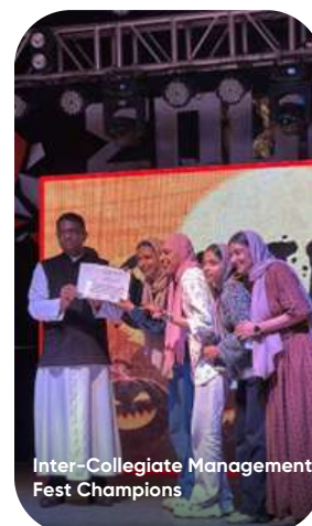
Inter-Collegiate Management Fest Champions