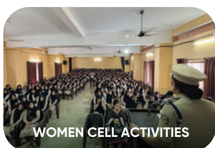
WOMEN CELL ACTIVITIES