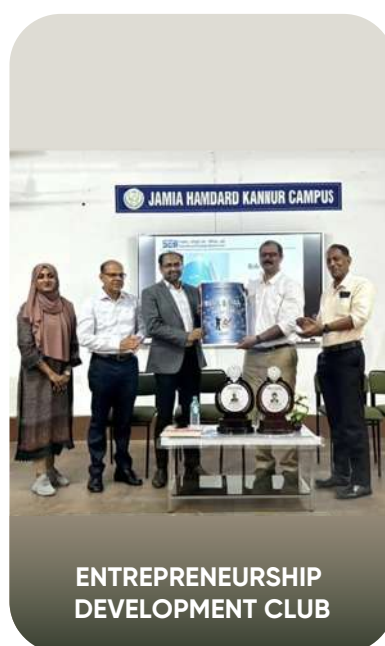
ENTREPRENEURSHIP DEVELOPMENT CLUB